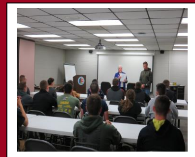
ROTC cadets at UW-Whitewater